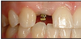
365 Skeletal Anchorage

Various types of differential moments are depicted on this month's cover, illustrating the article by Dr. Mulligan.