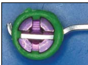
36 Attaching Wires