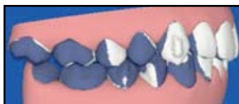
28 Class II Invisalign